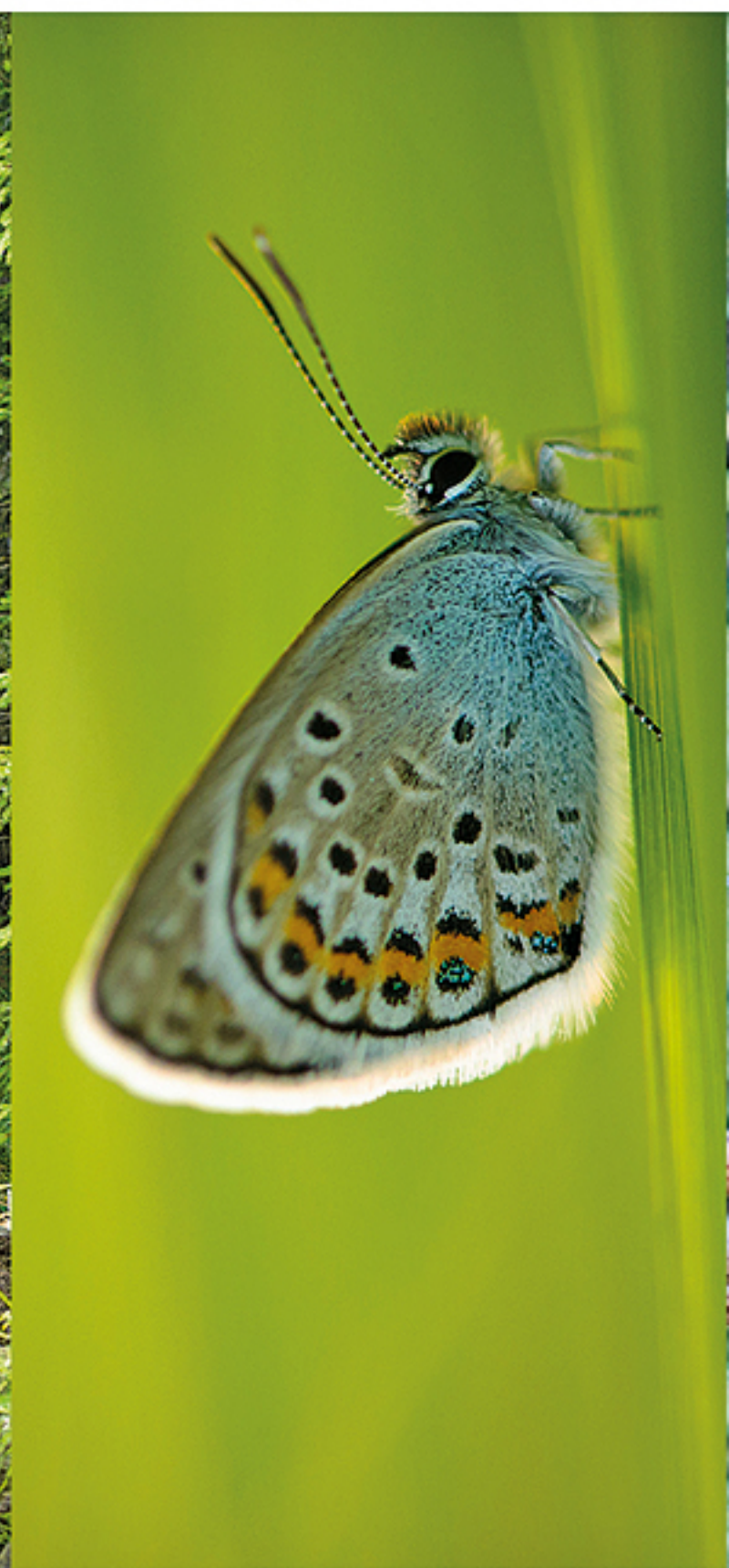
FLORA AND FAUNA OBSERVATION