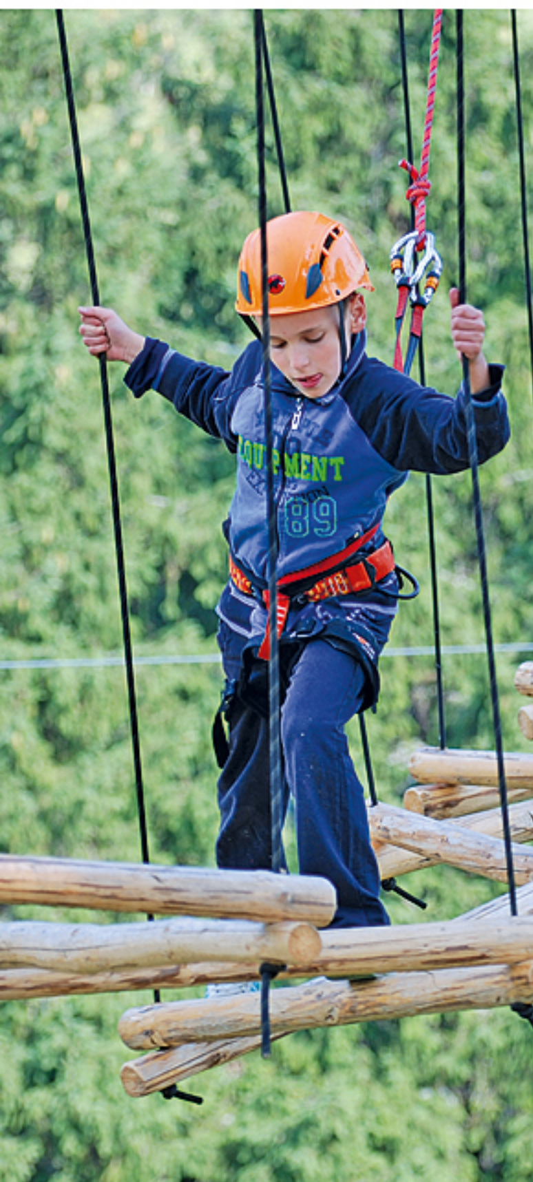
RÂUȘOR ADVENTURE PARK